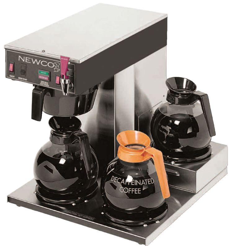
Decanters not included

All the features are built into a stainless steel cabinet for long stability and durability.