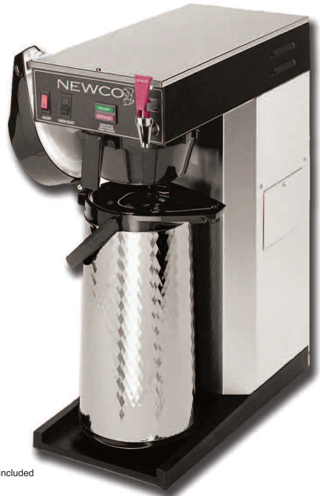
Air Pot not included

All the features are built into a stainless steel cabinet for long stability and durability.