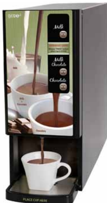
Also available in green

Equipped with two 2lb hoppers, the Bistro-2 was designed as a companion unit to NEWCO's Fresh Cup POD brewer. Deliver frothy hot milk and chocolate at the push of a button to create delicious cappuccino's, lattes and mocha chinos to both Coffee and tea PODS.