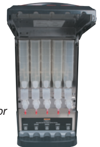
Top hinged door inside view

For current specification sheets and other information, go to www.bunn.com .